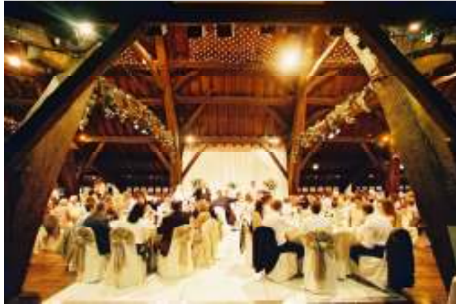
Interior of Rivington Hall Barn

All Civil Ceremonies and wedding receptions are organised to your individual requirements, and no other weddings or events will be taking place at the same time as yours.