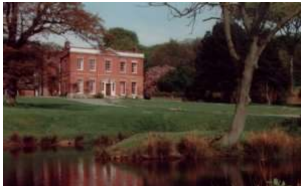
Rivington Hall and grounds

Rivington Hall is an imposing Georgian fronted house and provides a beautiful backdrop for your photographs.